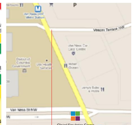
Garage Pay Parking