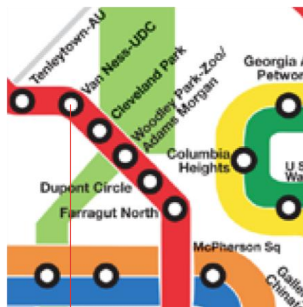
Van Ness/UDC station

There is a bus stop on Connecticut Avenue directly in front of the Clinical Simulation Center. Please refer to Metro Opens Doors for help planning your trip.